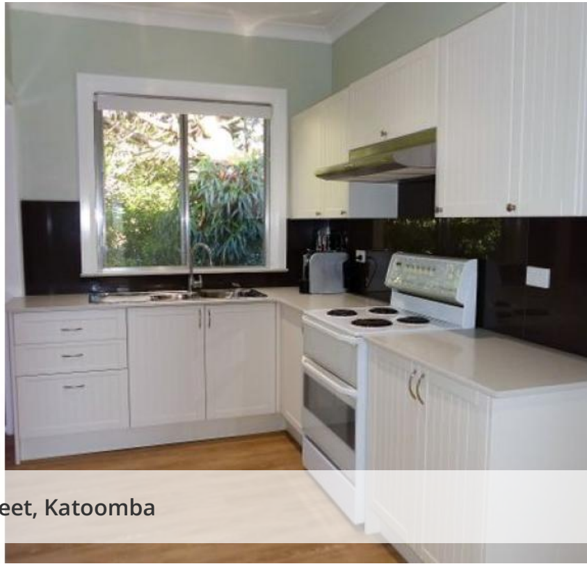
22 Cumberland Street, Katoomba