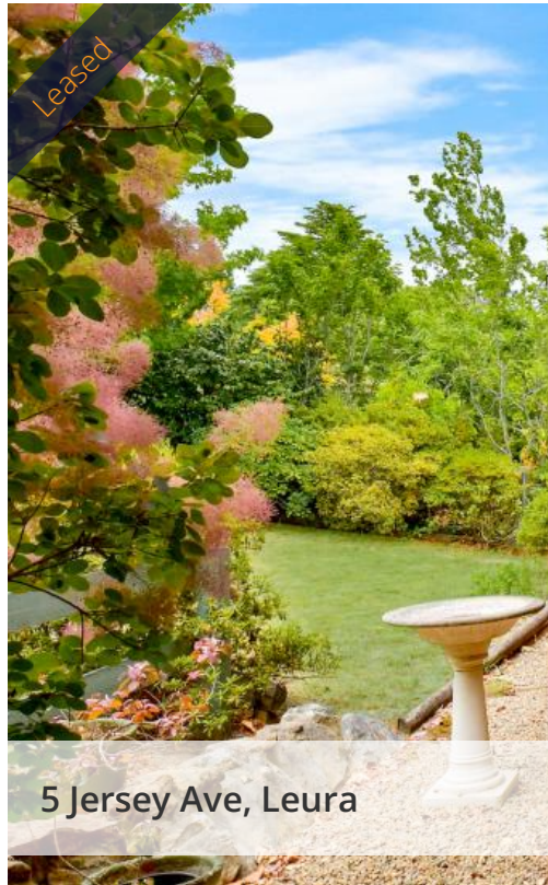
5 Jersey Ave, Leura