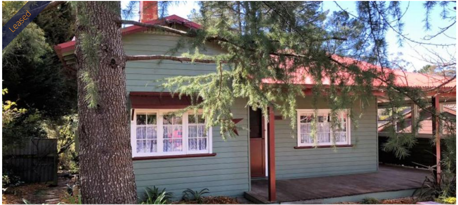
29 Wombat Street, Blackheath