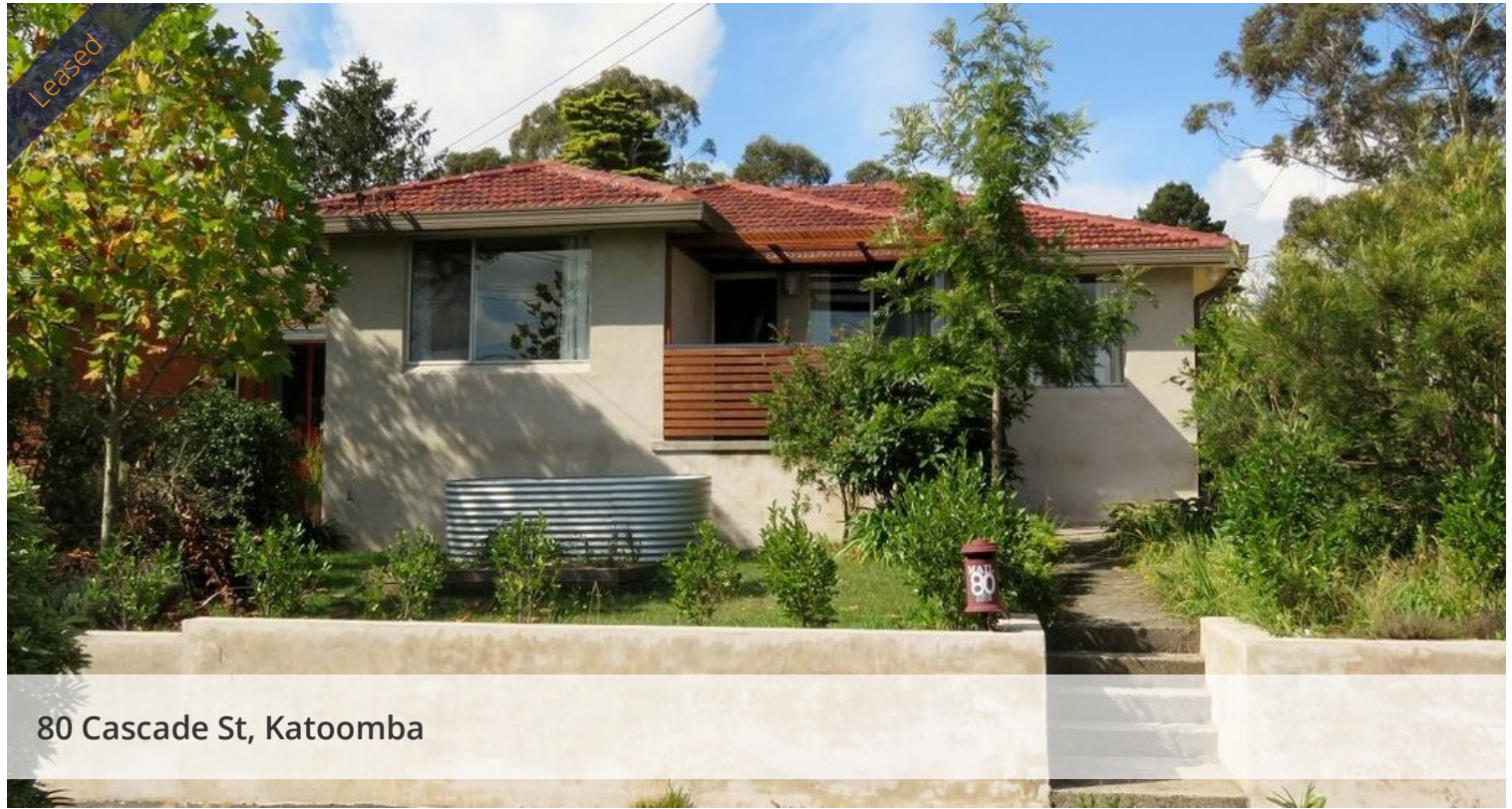
80 Cascade St, Katoomba